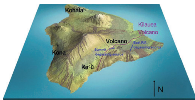
Figure 1 Geographic location of the four study sites on Hawaii Island, and major volcanic emission sources from Kilauea. Red dots represent the locations of the largest SO 2 degassing sources on Kilauea Volcano.