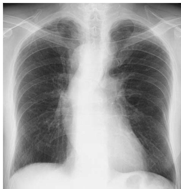
Figure 1 Chest radiograph from a posteroanterior view showing the abnormal shape of the aorta.

A KD was first described by Kommerell 1 in 1936 as a rare congenital aneurysm of the origin of the aberrant subclavian artery. Development of KD with RSA occurs in 0.5–1.0% of the population, whereas RAA with LSA is extremely rare, occurring in 0.05–0.1% of the population. 2 A cause of KD is an embryological abnormal regression of the primitive fourth aortic arch and ventral aortic root. Aneurysm of the KD may cause serious complications, including dissection and rupture. Three-dimensional