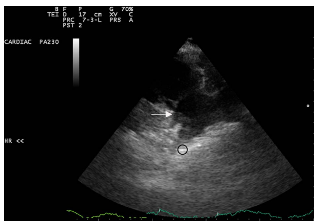
Figure 2 Right ventricular inflow view showing the coronary sinus drainage (arrow) close to the septal tricuspid valve leaflet. Inferior vena caval drainage is also shown (circled).

parameters. An echocardiographic study was performed with a 2.5 MHz transducer using the commercially available Philips HD7 equipment. Coronary sinus (CS) diameter was measured in apical four-chamber view with slight posterior angulation (figure 1). CS flow parameters and velocity time interval (VTI) were measured using a pulse-wave sample volume kept within