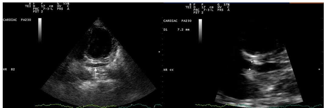
Figure 1 Apical four-chamber view with posterior angulation showing coronary sinus (arrow, left panel). Optimal zooming of the above view to measure coronary sinus diameter within 1 cm of its opening into right atrium.

All patients underwent TTE for complete evaluation of left ventricle internal dimensions, left ventricular ejection fraction (LVEF) and CSBF