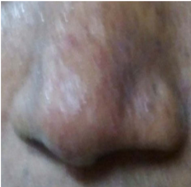
Figure 1 Lupus pernio.

She had lupus pernio in her nose this time (figure 1). Non-caseating granuloma was found in skin biopsy and diagnosis of sarcoid was made (figure 2). MRI was not possible because of pacemaker. There were small bilateral hilar lymphadenopathy in CT scan of chest without any parenchymal infiltration. Patchy involvement of septum and left ventricular free wall were seen in Thallium201 scan. 1 She was put on oral corticosteroid and dual-chamber implantable cardioverter-defibrillator (ICD) was implanted to prevent sudden cardiac death. Her VT load has decreased in follow-up, and she did not receive a single shock. Eventually, her pacemaker dependency has also decreased. In the USA, 13–50% of all sarcoidosis deaths have been attributed to cardiac involvement; in Japan, up to 85% of all deaths have been related to heart involvement. Though left ventricular free wall is the most common location, interventricu-